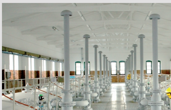
A Bollmann filter system of a pump station

Application: KefaTherm is available in industrial quality for coating systems and in airless quality for airless equipment.